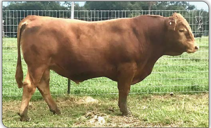
STRICKLAND SECRET AGENT - Lot 40

1/2 SM 1/2 AN, Black, Homo Polled Growth bull with carcass. High Road grandson out of a Sitz Upward daughter. Top 2% REA; 3% CW; 20% WW, YW. CONSIGNED BY STRICKLAND CATTLE