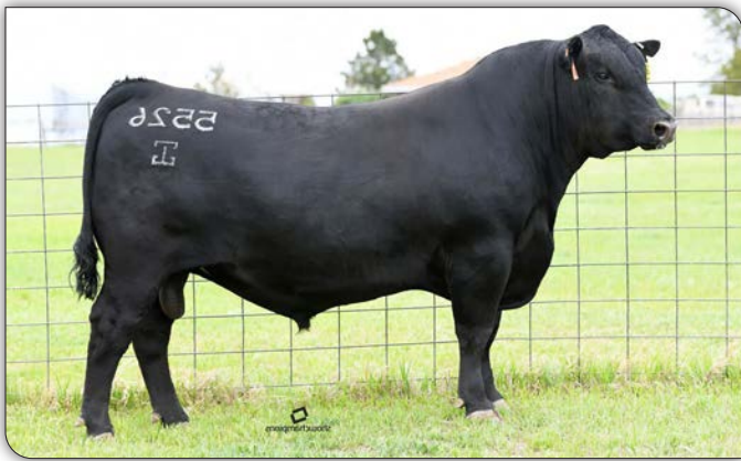
GAR Quantum - Sire of Lots 8,9,10.

Xceptional son out of a Sunrise daughter. Calving-ease bull with carcass; Top 20% $C, $B and RE. CONSIGNED BY BOYETT FARMS