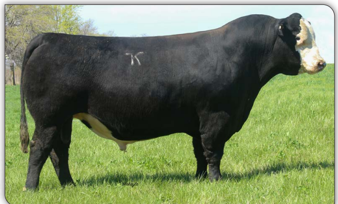
KSU Bald Eagle 53G: Sire of Lot 45