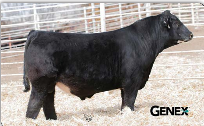
TJ Frosty 318E - Sire of Lots 30,31,32,33

1/2 SM 1/2 AN, Black, Homo Polled High Road grandson stemming back to Confidence on the bottom. Calving-ease bull with growth and carcass. Top 5% YW, TI; 10% WW, ADG, REA; 15% MWW, CW. CONSIGNED BY STRICKLAND CATTLE