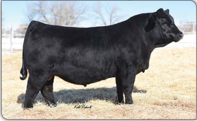
Hook's Eagle 6E - Sire of Lots 14 & 15

Heifer-safe Broken Bow son out of a Satisfaction daughter that stems from the Blackbird cow family. Maternal bull with production and carcass; a Targeting the Brand™ lot. CONSIGNED BY STRICKLAND CATTLE