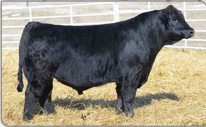
KBHR High Road E283 - Grandsire of Lots 36 -39