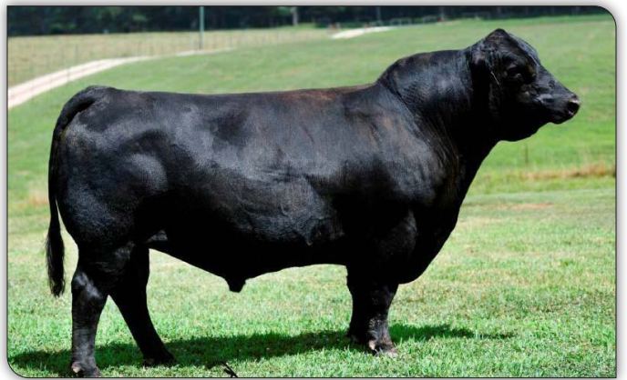
GW Triple Crown - Sire of Lots 21 & 22

3/4 SM 1/4 AN, Black, Polled High Road grandson out of a Yon Final Answer A35 daughter. CONSIGNED BY STRICKLAND CATTLE