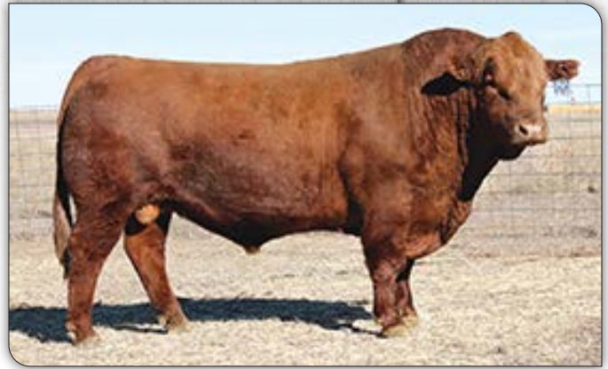
CDI SECRET AGENT 407C - Sire of Lot 40,41,42,43