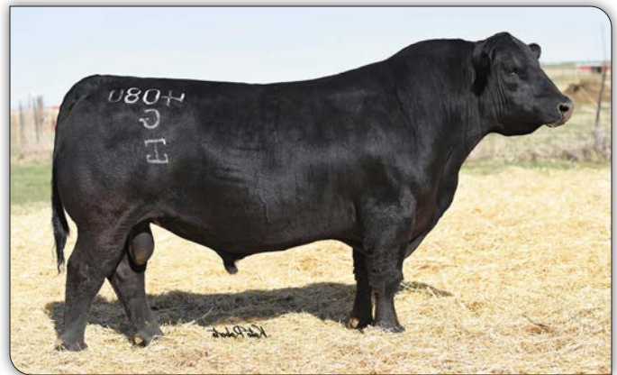
GAR Xceptional - Sire of Lots 5, 6, & 7