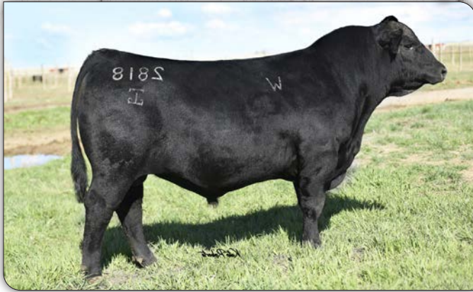
GAR Freedom - Sire of Lot 1