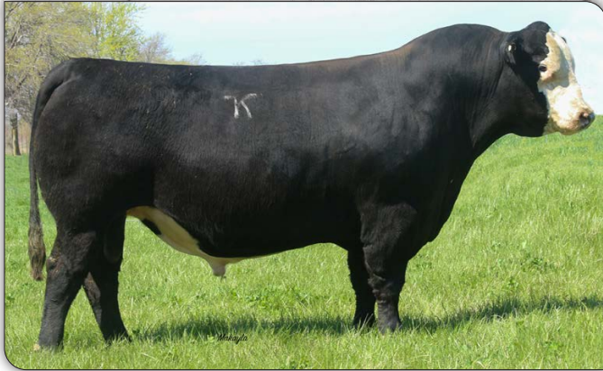
KSU BALD EAGLE 53G - Sire of Lots 25, 26, & 27