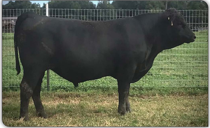
Strickland Eagle K 104

Broken Bow son out of a Resource daughter with maternal. Top 15% Milk, 20% $W, 25% YW. CONSIGNED BY STRICKLAND CATTLE