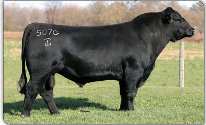
GAR Dual Threat - Sire of Lot 4