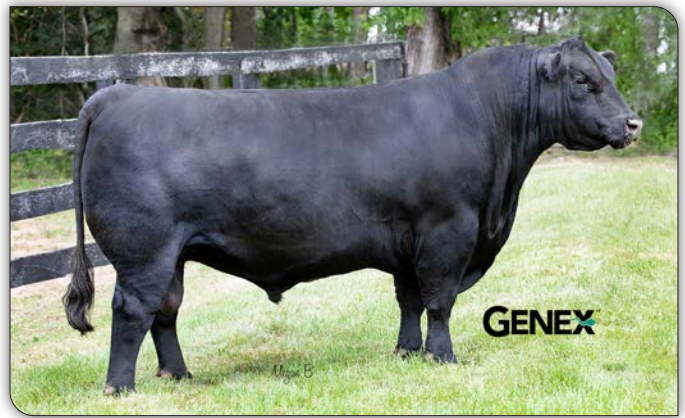
Butchs Trustee - AI Sire of Lot 11

Quantum son out of a Ten X daughter stemming from Wix cow family. Top 4% $M. CONSIGNED BY BOYETT FARMS